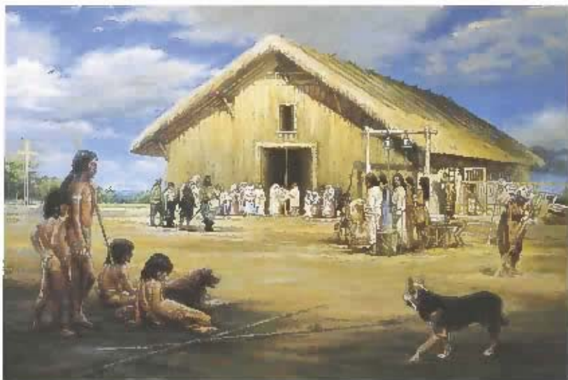
Spanish mission, 17th century (artist's rendition)

French response came two years later, when Dominique de Gourgues recaptured San Mateo and made the Spanish soldiers stationed there pay with their lives. However, this incident did not halt the Spanish advance. Their pattern of constructing forts and Roman Catholic missions continued. Spanish missions, established among the Indian people, soon extended across north Florida and northward along the coast as far as the area we now know as South Carolina.